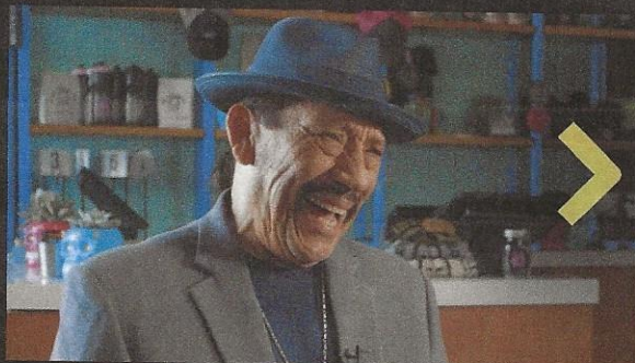
Danny Trejo on Being 51 Years Sober