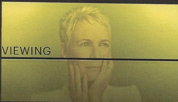
Jamie Lee Curtis Opens Up on Her Drug Addiction and Being in Recovery